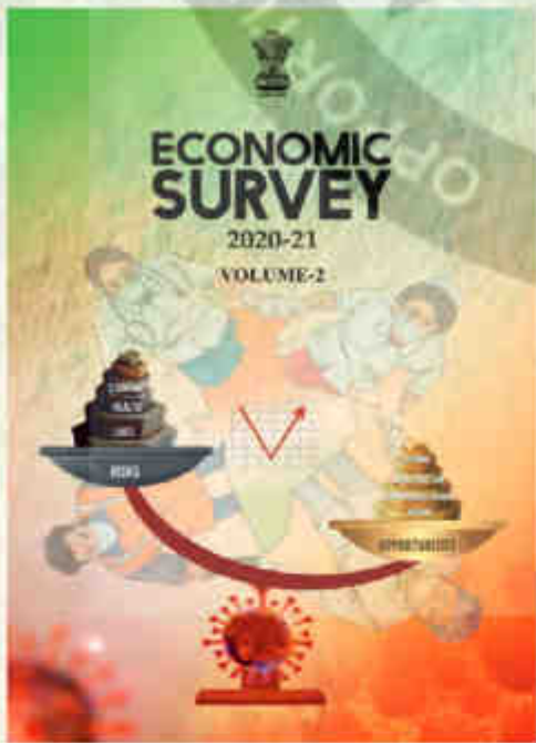
ECONOMIC SURVEY 2020-21 Volume-1 & 2

An in-depth review of economic development in India giving detailed statistical data of all the sectors- industrial, agricultural, manufacturing among others.