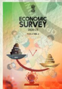
ECONOMIC SURVEY 2020-21 Volume-1 & 2

An in-depth review of economic development in India giving detailed statistical data of all the sectors- industrial, agricultural, manufacturing among others.